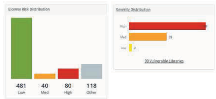
Licenses Risk & Severity Distribution

The license risk distribution chart (left) and the Vulnerability Severity distribution chart (right), describe the overall risk status of an organization's codebase.